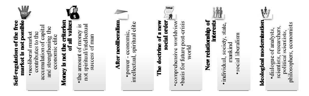
Figure 2 Prospects of the neoliberal world economic system development

The dominance of liberal ideas in recent decades has led to the fact that not economy fit into the system of social relations, but rather social relationships fit into the economic system. It has disastrous consequences for society. In the context of globalization and the information revolution the neoliberalism leads to de-industrialization of small countries, their losses from competitive countries-leaders and global corporations. Neo-liberal system contributed to the increase in banking assets and a maximum privatization in all parts of the economy and social life. Industries, enterprises and institutions of educational, medical, scientific and even military orientation were completely in private hands. State, at this time, serves as a guarantor that protects the right on private property, own and foreign capital (Held. D., Mc. Grew, 2007). In the neoliberal world, the contract form is widely used as the basis of social relations, which is short-termed, and has a monetary measurement. Contracts are not only for goods and services but even for the health, motherhood and honor of the person. Overview of the neoliberal system of world economy gives a reason to formulate its prospects (see. Fig. 2).