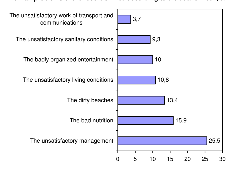
Picture 3. The vital problems of the resort Crimea according to the data of 2007, %

To change the situation, we should use the foreign experience, being gained in the sphere of service in order to formulate the certain rules of the qualitative service organization in the health resort and recreational sphere, where there are two main criteria: 1) the interrelation of the standards and needs of resting people, 2) the creation of the special technologies concerning management of the quality of work of the resort enterprises. The new level of quality is connected with the approach of the customer service on the base of the introduction of the quality management system ISO 9000–2001 and modern methods of quality management.