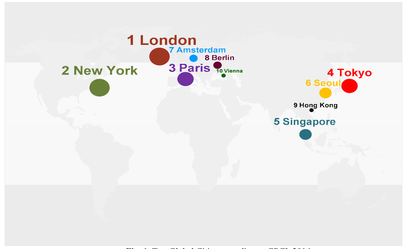
Fig. 1. Top Global Cities according to GPCI, 2014

Accordingly, London and New York swapped places in this ranking: London retains its place at the top of the ranking followed by New York (Figure 1).