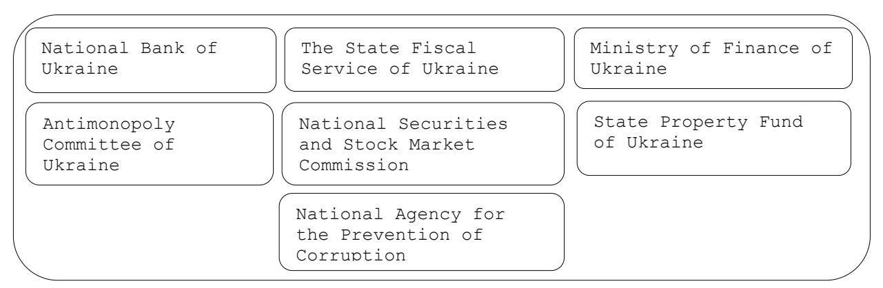
Fig. 2. Interaction of the National Commission on Securities and Stock Market with other state bodies * *Comprised by the author themselves.

In the domestic stock market, in general, there are similar features, as in most major emerging markets. On the one hand, we are witnessing high rates of positive quantitative and qualitative changes; on the other hand, there are numerous problems that hinder its more effective development.<sup>4</sup>