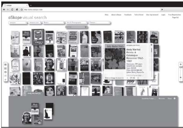
Fig. 1 – Basic elements of visual search at oSkope visual search