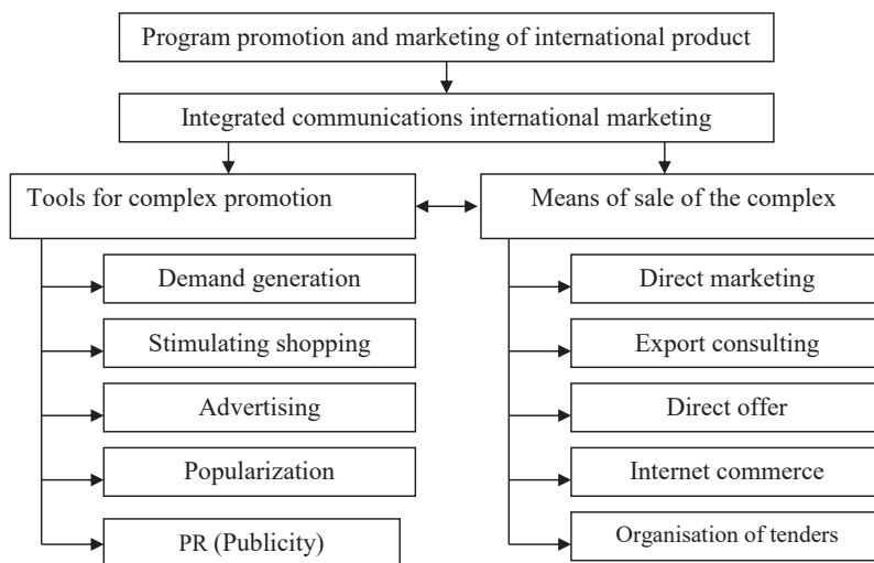
Figure 1. The structure of the international integrated marketing communications

Therefore, from the theoretical point of view, it is important to define a functional role, value and potential of