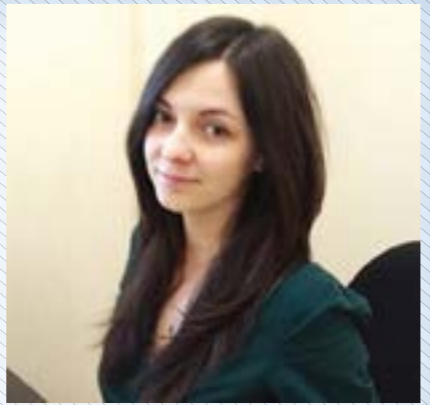
Svitlana Makovetska , Secretariat of the Ukrainian Parliament Commissioner for Human Rights

At the same time, monitoring results had revealed the existence of the common problem of local authorities - lack of awareness concerning the mechanisms of IDPs rights realization.