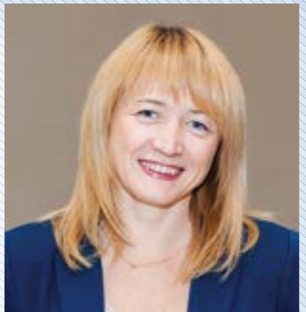
Svitlana Kryvda , Secretariat of the Ukrainian Parliament Commissioner for Human Rights:

In our monitoring missions, we had positive impressions from medical institutions in Voznesensk, Mykolaiv Oblast, and in Chernivtsi, where they are constantly working on the organization of processes of personal data protection and processing. Social protection departments are usually at an average level, mostly because of a considerable volume of information that they have to process. Educational institutions, as well as military governance bodies, usually have documented regulations on the personal data processing procedures, but regulations of educational institutions are often based on obsolete laws and their work in the area of personal data protection calls for considerable improvements.