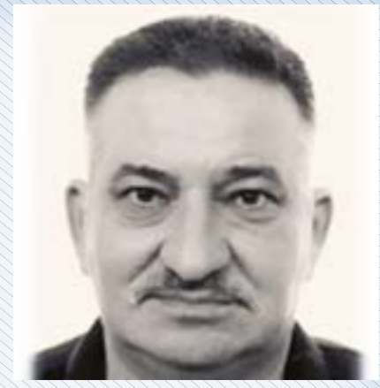
Dmytro Volokhin , Secretariat of the Ukrainian Parliament Commissioner for Human Rights

In my opinion, one of missteps observed during the monitoring visits is that not all local government bodies have appointed an official or structural subdivision in charge of coordination of activities in the field of protection of rights of mobilized soldiers, ATO participants and their families, as well as of the families of the fallen.