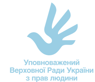
Valeriya Lutkovska, Ukrainian Parliament Com- missioner for Human Rights

A FEW YEARS AGO , Ukraine launched the process of decentralization, which consists in delegating significant powers and budgets to local government bodies. The main objective is to give more powers to those authorities that are closer to people, where these powers can be exercised in the most successful way.