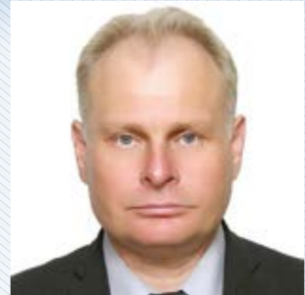
Pavlo Kaminsky , Secretariat of the Ukrainian Parliament Commissioner for Human Rights

As a member of monitoring team in Chernivtsi, I would like to mention a program of comprehensive support to military personnel and their families that was adopted by the local city council. This program not only warrants enforcement of guarantees and social benefits approved by the government, but also extends their scope by means of local capabilities.