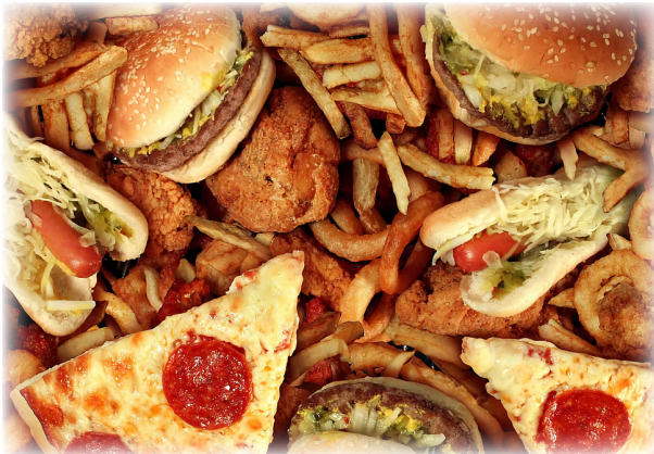
Picture B. Junk food

[Download URL: https://food-guide.canada.ca/en/tips-for-healthy-eating/make-healthy-meals-with-the-eat-well-plate/ ]