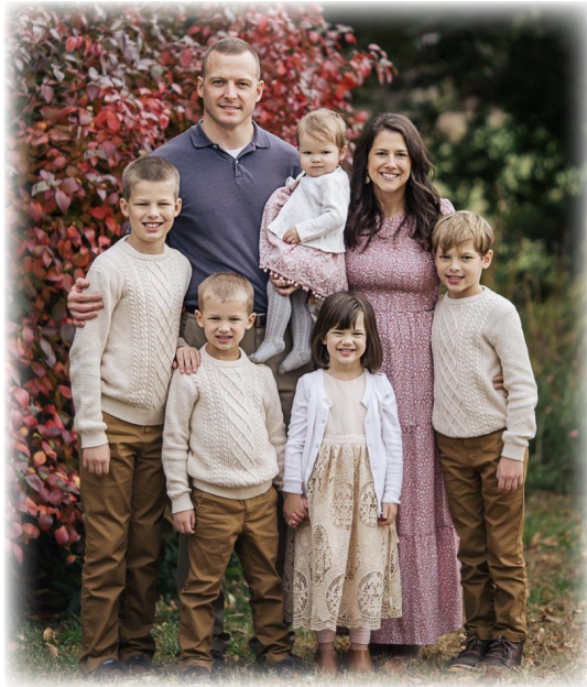
Picture B. A big family

[Download URL: https://create.vista.com/uk/unlimited/stock-photos/143116347/stock-photo-happy-family-with-one-child/ ]