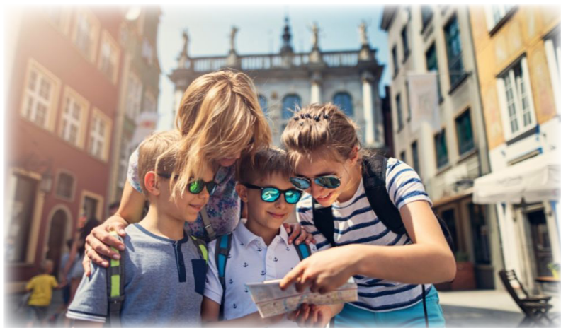
Picture A. City break

[Download URL: https://www.thetraveldaily.co.uk/article/2023/03/08/best-city-breaks-families-2023 ]