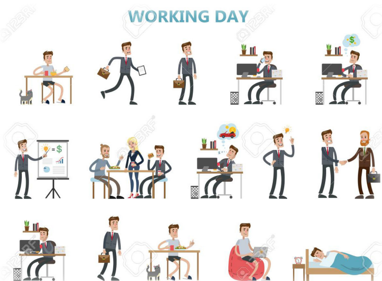
Picture B. An office worker's day

[Download URL: https://www.vectorstock.com/royalty-free-vector/cartoon-color-characters-woman-housewife-set-vector-22877563 ]