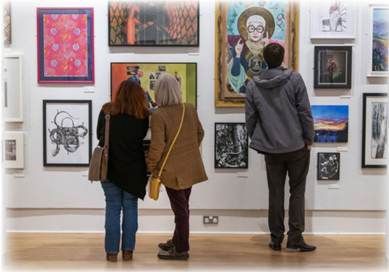
Picture A. An art gallery

[Download URL: https://www.mutualart.com/Exhibition/The-People-s-Exhibition/DA18666799473C5E ]