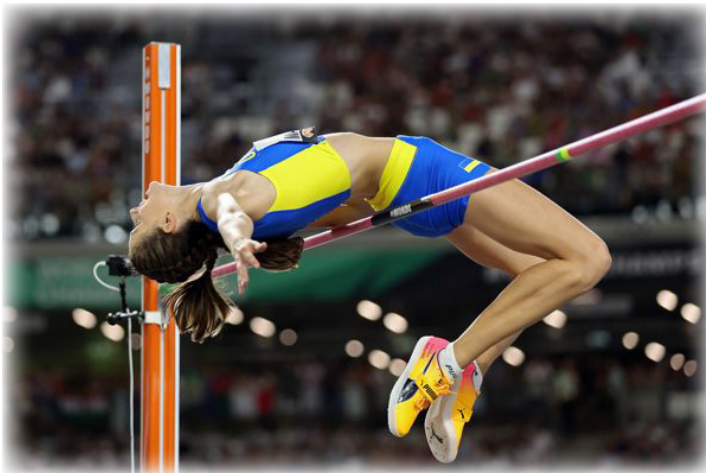
Picture B. An individual sport

[Download URL: https://unsplash.com/s/photos/team-sport ]