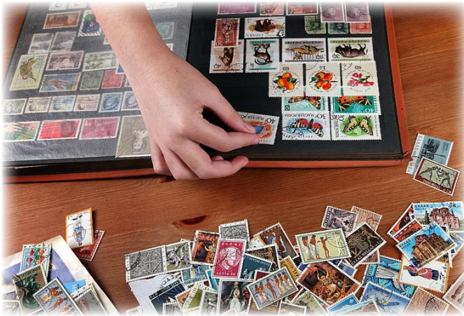
Picture B. Collecting stamps

[Download URL: https://www.freepik.com/premium-photo/garden-bed-good-looking-woman-feeling-joyful-happy-while-leaning-her-garden-bed-planting-new-little-flowers_13779805.htm ]