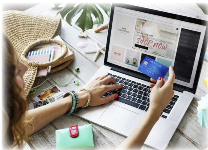
Picture B. Online shopping

[Download URL: https://www.babbel.com/en/magazine/clothes-shopping-in-other-countries ]