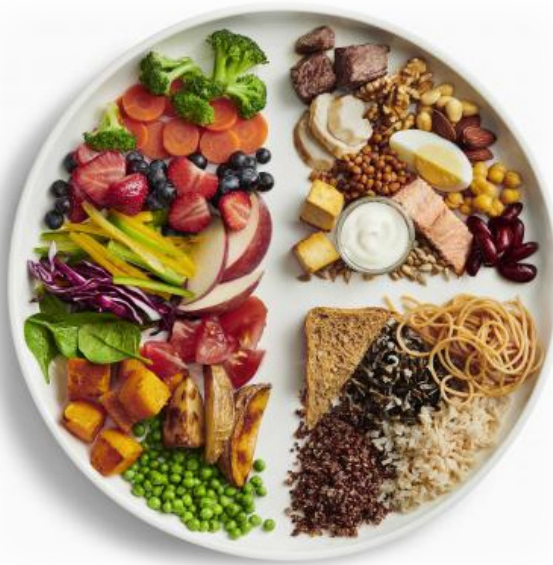
Picture A. A healthy plate

[Download URL: https://food-guide.canada.ca/en/tips-for-healthy-eating/make-healthy-meals-with-the-eat-well-plate/ ]