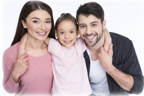
Picture A. A small family

[Download URL: https://create.vista.com/uk/unlimited/stock-photos/143116347/stock-photo-happy-family-with-one-child/ ]