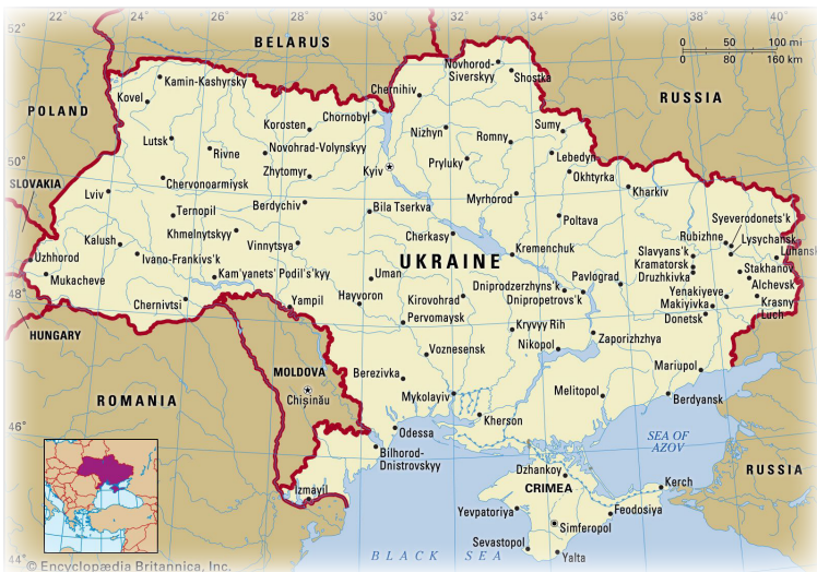
Picture A. A map of Ukraine

[Download URL: https://www.britannica.com/place/Ukraine ]