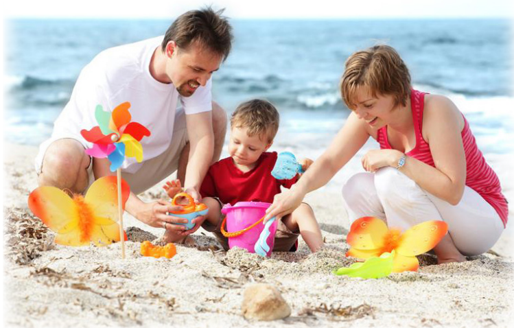
Picture B. Holiday at the sea

[Download URL: https://www.thetraveldaily.co.uk/article/2023/03/08/best-city-breaks-families-2023 ]