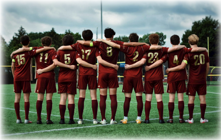
Picture A. A team sport

[Download URL: https://unsplash.com/s/photos/team-sport ]