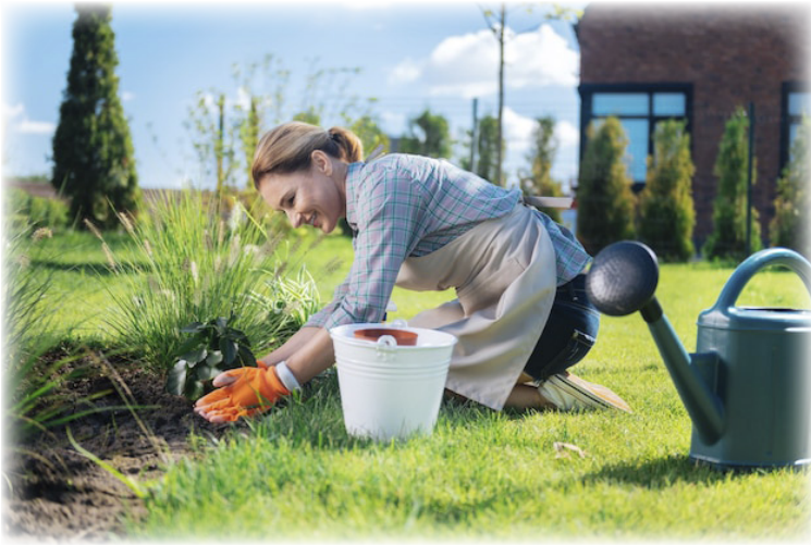
Picture A. Gardening

[Download URL: https://www.freepik.com/premium-photo/garden-bed-good-looking-woman-feeling-joyful-happy-while-leaning-her-garden-bed-planting-new-little-flowers_13779805.htm ]