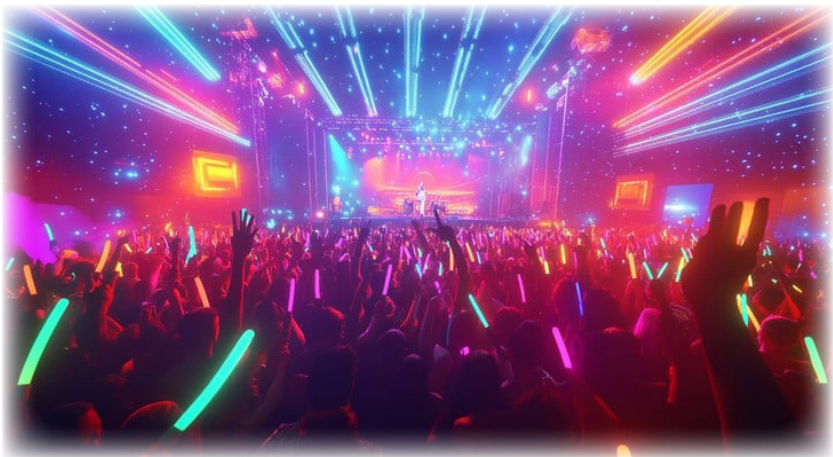
Picture B. A concert

[Download URL: https://www.mutualart.com/Exhibition/The-People-s-Exhibition/DA18666799473C5E ]