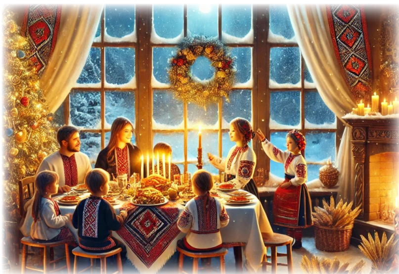
Picture A. A Ukrainian family celebrating Christmas Eve

[Download URL: https://recepty.uaplatforma.com.ua/rizdvo-hrystove-rizdvo-v-ukrayini-rizdvyani-svyata-rizdvo-hrystove-tradycziyi/ ]