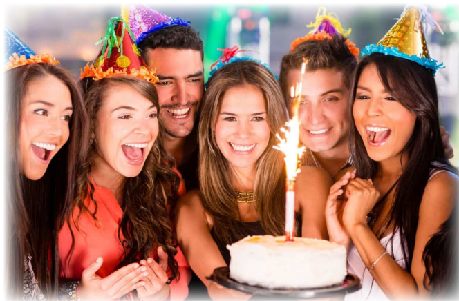
Picture B. A birthday party

[Download URL: https://recepty.uaplatforma.com.ua/rizdvo-hrystove-rizdvo-v-ukrayini-rizdvyani-svyata-rizdvo-hrystove-tradycziyi/ ]